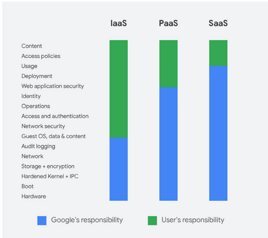
Shared responsibility model for Google Cloud Platform