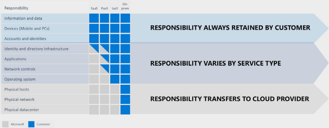
Shared responsibility model for Microsoft Azure